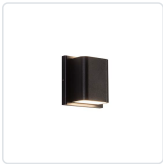
AT48426-BK-UNV- 3CCT Black