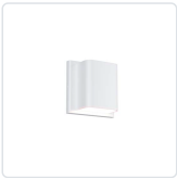
AT48426-WH-UNV- 3CCT White