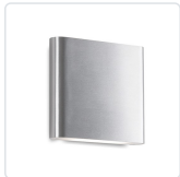
AT6506-BN-UNV Brushed Nickel