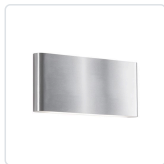
AT6510-BN Brushed Nickel