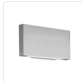
AT6610-BN-UNV Brushed Nickel