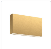
AT6610-BG-UNV Brushed Gold