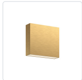
AT67006-BG-UNV Brushed Gold