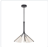
CH62628-BK/LG Black/Light Guide