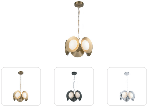
CH77916-BG/OP-UNV Brushed Gold/Matte Opal Glass