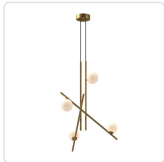
CH89832-BG/GO-UNV Brushed Gold/Glossy Opal Glass