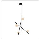
CH89832-BK/GO-UNV Black/Glossy Opal Glass