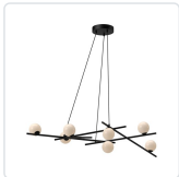
CH89854-BK/GO-UNV Black/Glossy Opal Glass