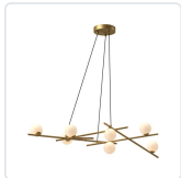
CH89854-BG/GO-UNV Brushed Gold/Glossy Opal Glass