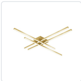
FM18247-BG Brushed Gold