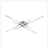
FM18247-BN Brushed Nickel