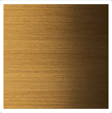
Vintage Brass (VB)