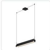
LP73536-BK/WH- UNV Black/White