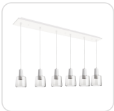
MP12506WHCL-06 White/Clear Glass