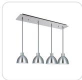
MP1706BN-04 Brushed Nickel