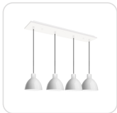
MP1706WG-04 Glossy White