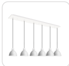
MP1706WG-06 Glossy White

Combining new LED lighting technology and a classic silhouette, the Chroma pendants thrive in both contemporary and transitional interiors. Handsome cloth covered cable suspends the dome shade and provides a chic contrast to the plated finishes. Various monochromatic options abound for the fixture exterior while the interior remains white for reflectance.