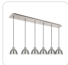
MP1706BN-06 Brushed Nickel