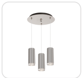
MP401431BN-03 Brushed Nickel