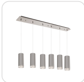
MP401432BN-06 Brushed Nickel