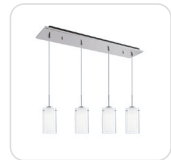
MP41304BN-04 Brushed Nickel