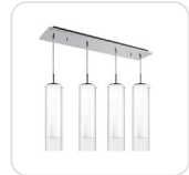
MP41305BN-04 Brushed Nickel