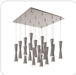
MP42502BN-16 Brushed Nickel