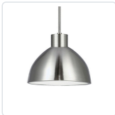
PD1709-BN Brushed Nickel