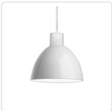
PD1709-WG Glossy White