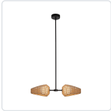
PD20602-BK/OP-UNV Black/Opal Matte Glass