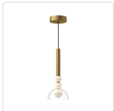
PD30502-BG/CL-UNV Brushed Gold/Clear