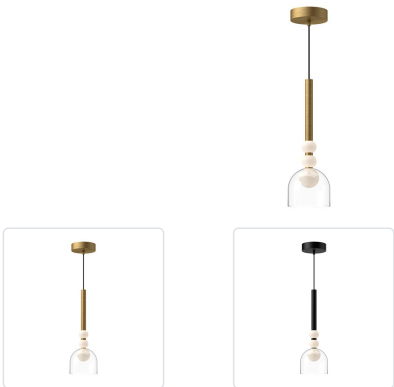
PD30505-BG/CL-UNV Brushed Gold/Clear