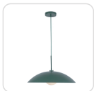
PD56019-PGN Pine Green

The Regent collection offers a refined blend of timeless design and modern color options, featuring a curated palette of neutral undertones. Its classic wide dome shade, paired with a softly glowing opal diffuser, exudes elegance while maintaining a fresh, contemporary vibe. Regent's versatile style adds a subtle yet impactful pop of color to any room.