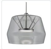
PD61418-SM/BN Smoked/Brushed Nickel