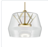
PD61418-CL/BG Clear/Brushed Gold