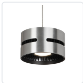
PD6705-BN Brushed Nickel