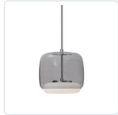
PD70610-SM/BN-UNV Smoked/Brushed Nickel