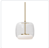
PD70610-CL/BG Clear/Brushed Gold