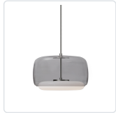
PD70615-SM/BN-UNV Smoked/Brushed Nickel