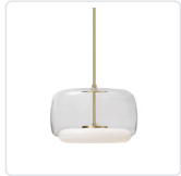
PD70615-CL/BG-UNV Clear/Brushed Gold