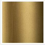
Brushed Gold (BG)