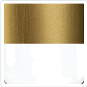
Brushed Gold/Clear Glass (BGCL)

* For custom options, contact customer service. * For warranty information, please visit www.kuzcolighting.com/warranty