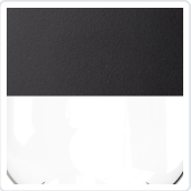
Matte Black/Clear Glass (MBCL)