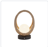
TL20610-BK/OP Black/Opal Matte Glass