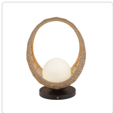
TL20616-BK/OP Black/Opal Matte Glass