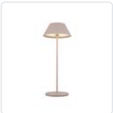
TL67914-MN Moonstone Gray