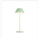
TL67914-GN Sage Green