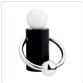
TL73708-MB/CH Matte Black/Chrome