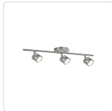
TR10022-BN Brushed Nickel