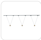
TR3L-P27203-BG Brushed Gold