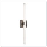
VL17024-BN Brushed Nickel