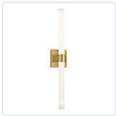
VL17024-BG Brushed Gold