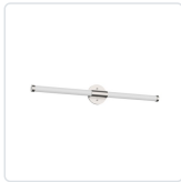
VL18532-BN Brushed Nickel