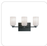
VL57718-BK/GO Black/Glossy Opal Glass