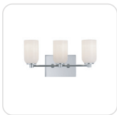
VL57718-CH/GO Chrome/ Glossy Opal Glass