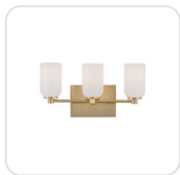
VL57718-BG/GO Brushed Gold/Glossy Opal Glass