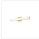
VL61220-BG Brushed Gold