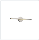
VL63724-BN Brushed Nickel