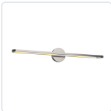
VL63736-BN-UNV Brushed Nickel