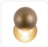
WS23212-VB Vintage Brass