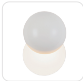
WS23212-PW Pearl White