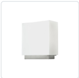
WS3909-BN Brushed Nickel