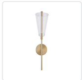
WS62524-BG/LG-UNV Brushed Gold/Light Guide