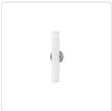
WS8318-BN Brushed Nickel