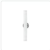
WS8324-BN Brushed Nickel